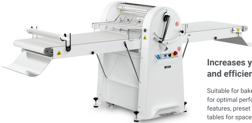
2025 Model Pictured

ITEM: 49010 49011 MODEL: BE-IT-1200-FSS BE-IT-1500-FSS